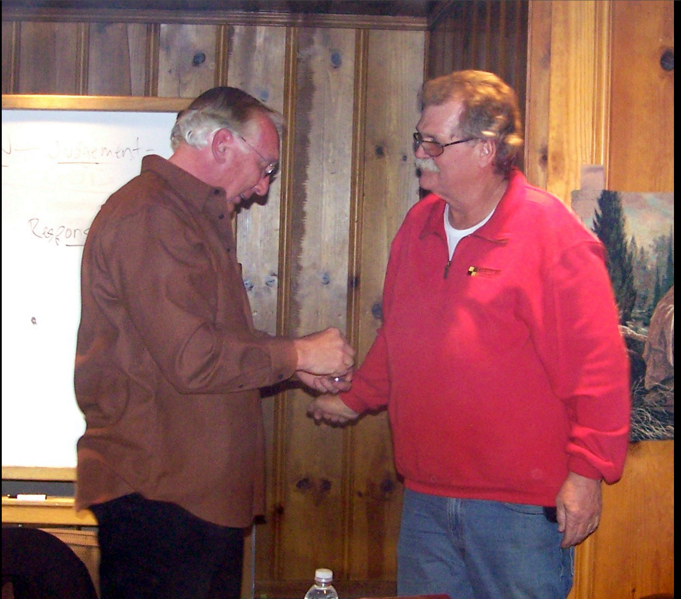
Sunday, May 24, 2009