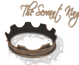
The story of the King... who came to serve.