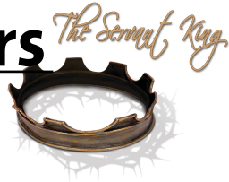
The story of the King... who came to serve.

"The Servant King" - #36 Noah Largent 10/28/12