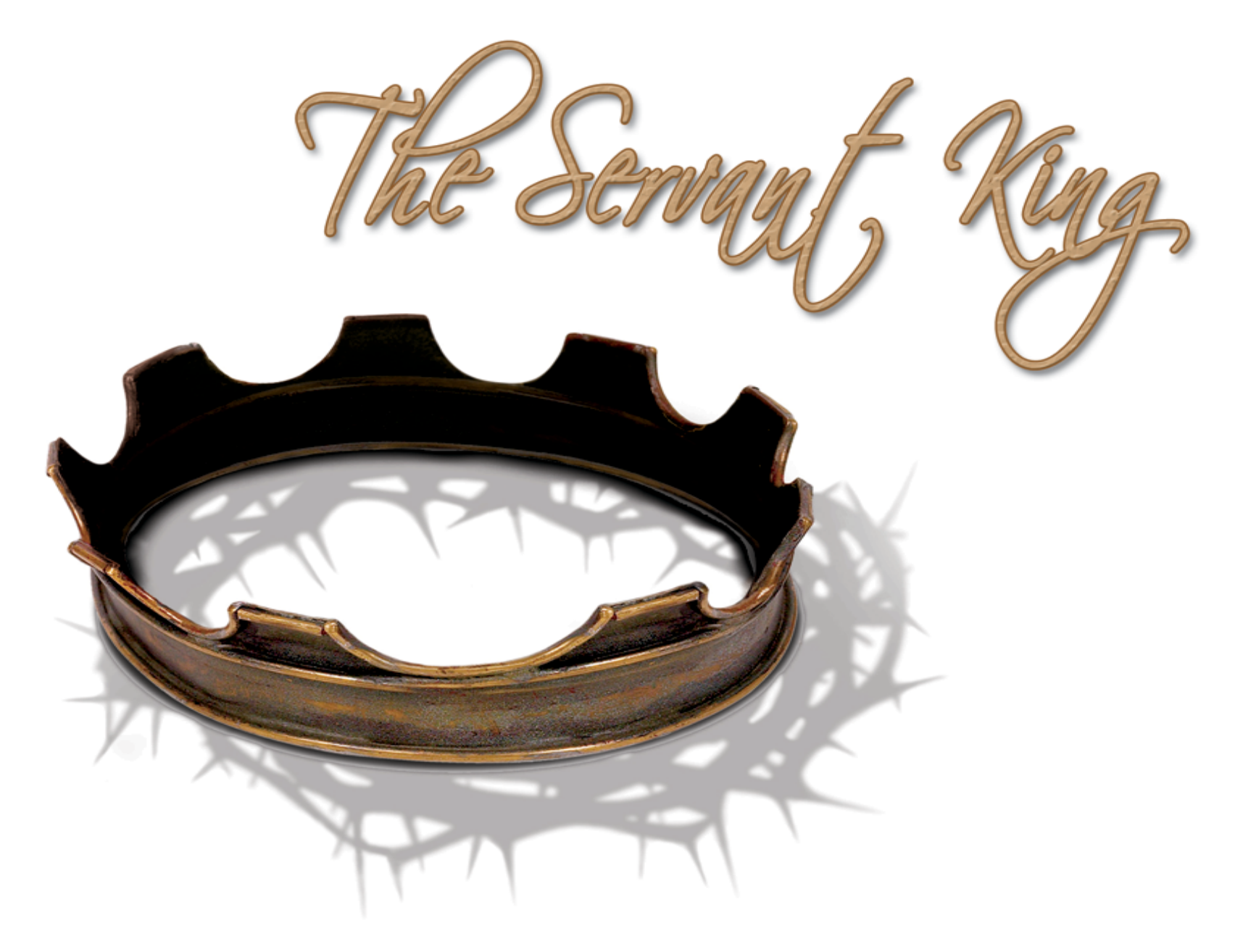
The story of the King... who came to serve .