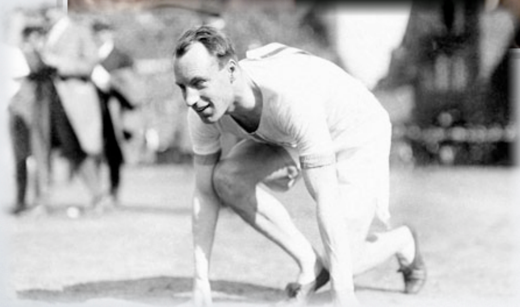
Eric Liddell 1902-1945 Olympic Gold Medalist Missionary to China