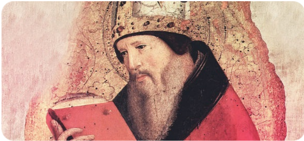
Augustine of Hippo

Men go abroad to admire the heights of mountains, the mighty waves of the sea, the broad tides of rivers, the compass of the ocean, and the circuits of the stars, yet pass over the mystery of themselves without a thought. -Confessions (397AD)