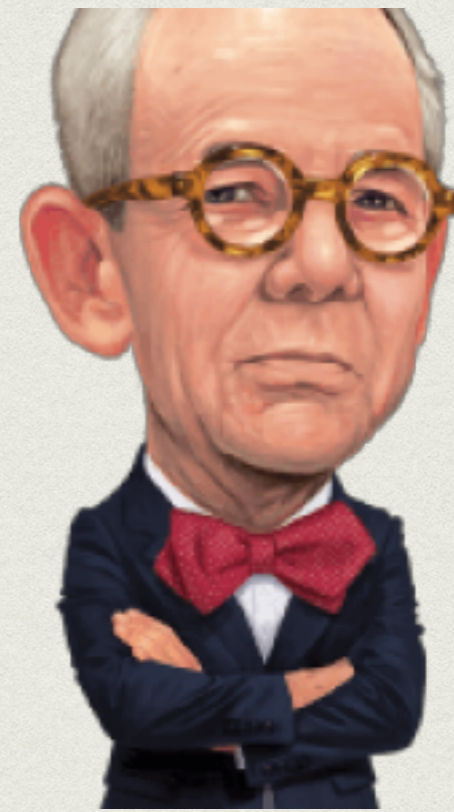
WRITER JOSEPH EPSTEIN

"So many people hate snobs. They just hate snobs, but you can only hate snobs if you feel superior to them, which means hating snobbery is a form of snobbery because humble people don't feel superior to anyone."