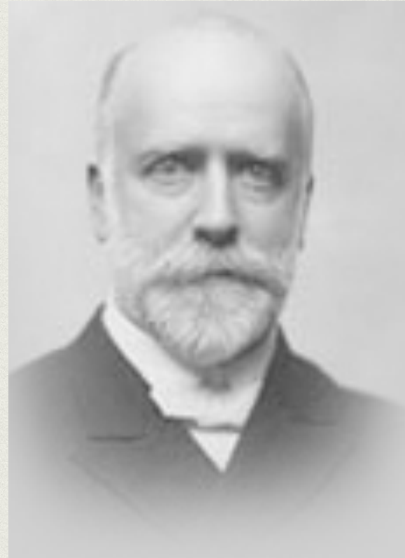
Pastor R.A. Torrey Founder of BIOLA seminary

“Adam was like that first man who fell on the climb. Our first ancestor fell, and we all inherited this fallen nature from Adam.”