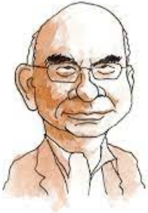
Tim Keller Author/Pastor