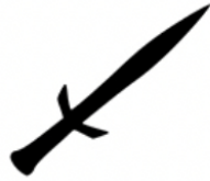
SWORD OF SPIRIT

Paul explicitly links his imagery in his letters to the divine armor of the messianic king in Isaiah. The point is that God's weapons have now been transferred to the new humanity, who are united in and with the Messiah. So whether it be defensive or offensive, they will need to put on the character of the Messiah and be prepared to fight.