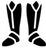
SHOES OF PEACE