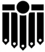
BELT OF TRUTH